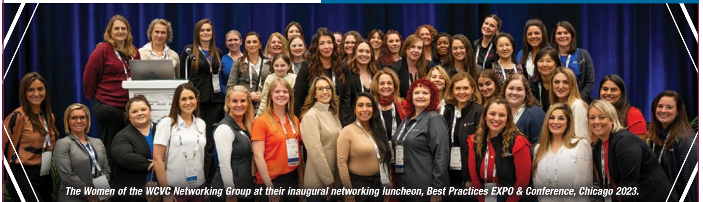
The Women of the WCVC Networking Group at their inaugural networking luncheon, Best Practices EXPO & Conference, Chicago 2023.

Join the Women in Compressed Air, Vacuum & Cooling (WCVC) Networking Group We look forward to meeting you soon!