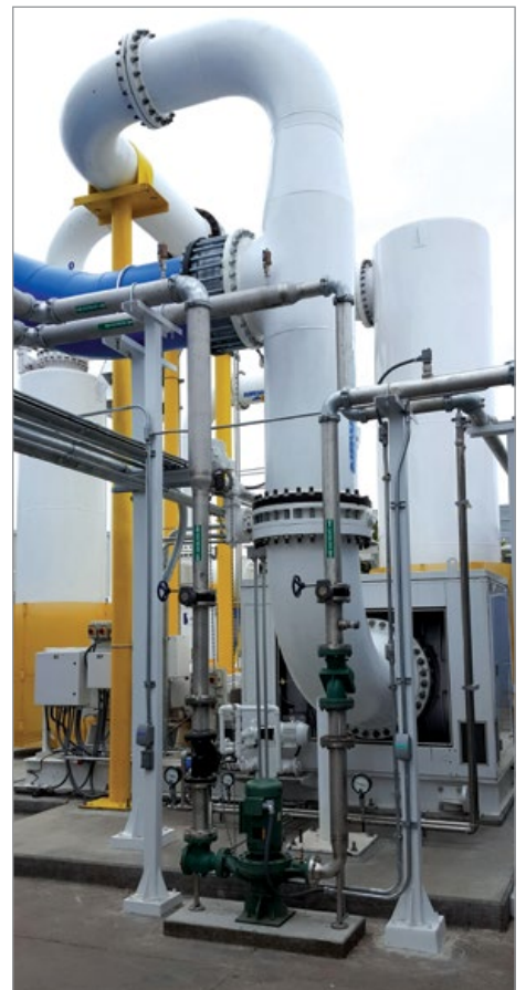
Installed at a large aerospace manufacturing facility, the multi-stage vacuum system is used in conjunction with an altitude simulation chamber to test aircraft parts at different atmospheric conditions.

pdblowers also implemented variable speed drives (VSDs) into its design to realize the variable speed needed. Use of a variable frequency drive (VFD) is key to real-time adjustments of vacuum levels. The customer control system, meanwhile, provides an