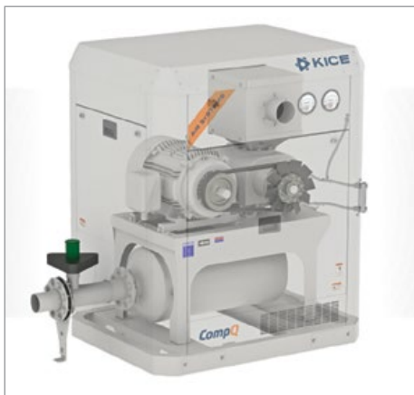
Kice Industries unveils newer, quieter blower package for processing plants.

According to the Occupational Safety and Health Administration, hearing loss affects thousands of workers annually. In 2021, OSHA developed enforcement strategies to address noise hazards in manufacturing and processing