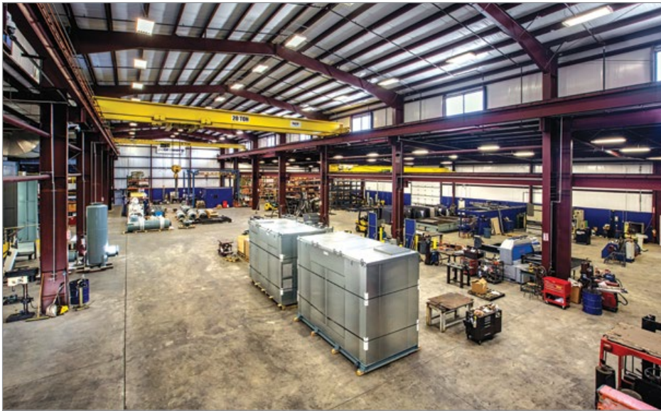
The 50,000-square-foot facility at pdblwers' campus in Gainesville, Georgia

“Our custom control system would feature an operator-friendly Human Machine Interface [HMI] to easily input the required mass flow and vacuum level, and monitor how the system is performing,” Hene said of the control’s capabilities. “The client’s long-term plans include tying our control system into their existing test software.”