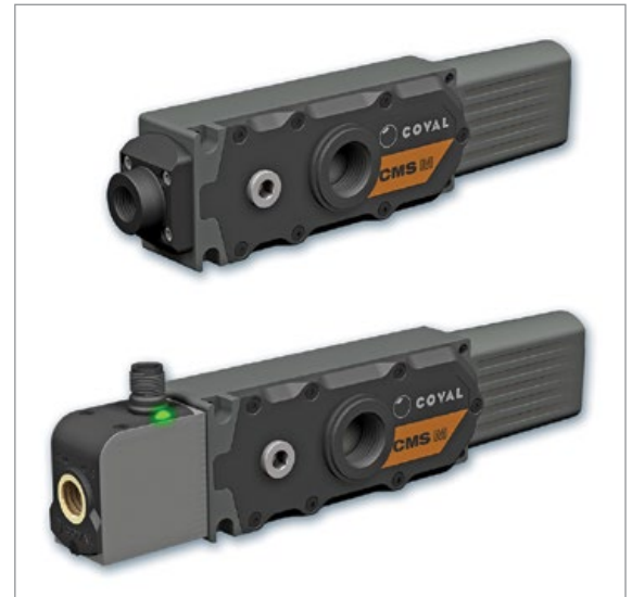
COVAL launches the new generation of multi-stage mini vacuum pumps: the CMS M Series.

COVAL's multi-stage technology maximizes the energy input of compressed air by cascading several stages of Venturi profiles and combining their respective suction flows. Intermediate valves progressively isolate each