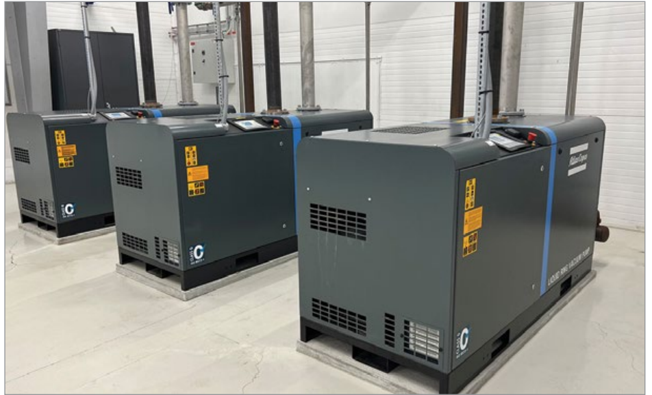
Three liquid ring vacuum pumps from the LRP VSD+ series from Atlas Copco are used on Lovund.

“The closed water circuit means that leaking seal water is collected in a tank and recirculated,” said Mikalsen. This recovery secures the water supply. An additional energy recovery also reduces production costs. To achieve this, the LRP VSD+ series is equipped with the powerful, user-friendly Elektronikon™