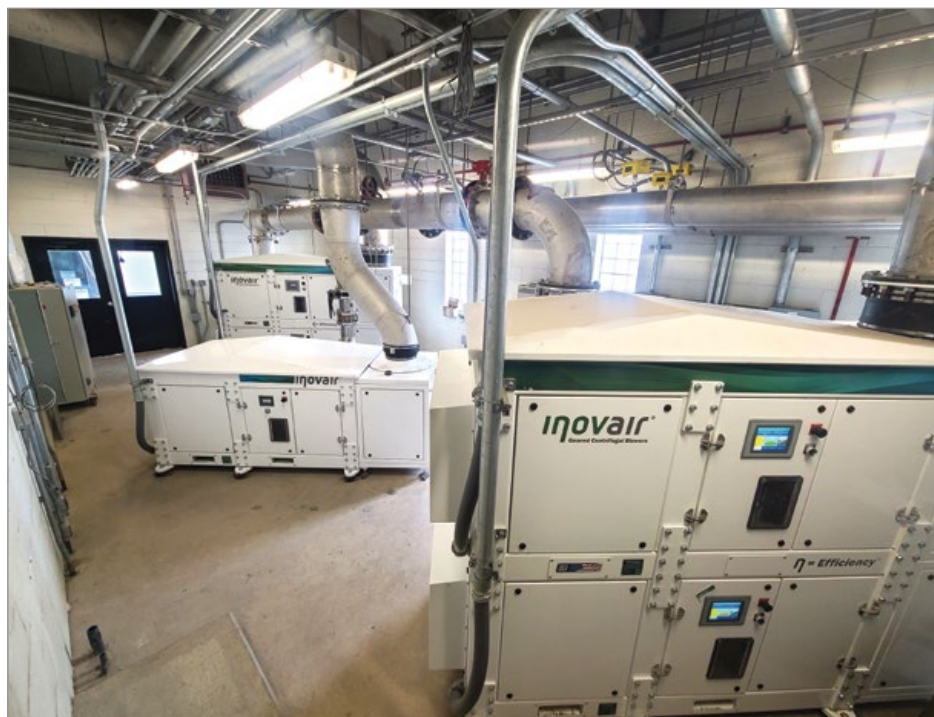
The Lafayette Wastewater Treatment Plant is now home to five Inovair IM-30 centrifugal blowers: four in double-stack configurations and one operating as a swing blower in the middle.

by the DO level. So because we do all the programming and all the control system work in-house, we were able to accommodate their request on that and it works well,” Jones says.