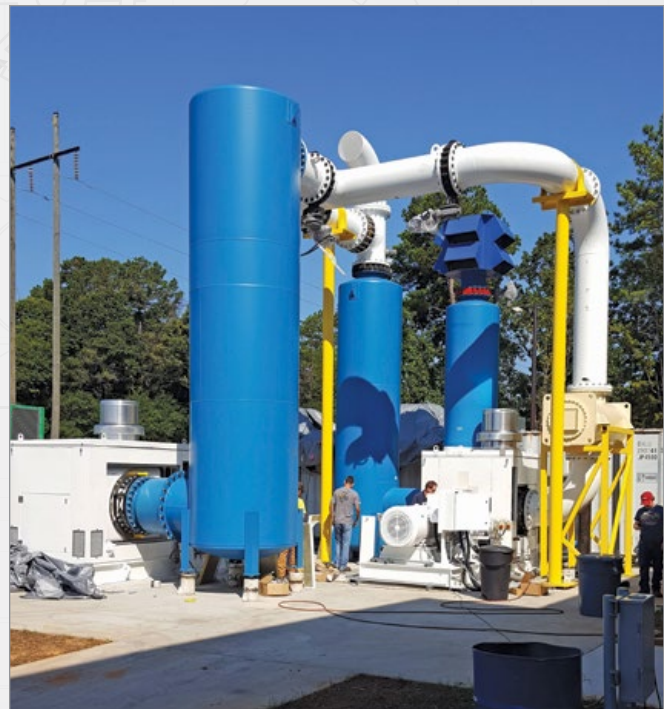
The first stage of the system provides higher mass flow and lower vacuum, while the second offers lower mass flow and higher vacuum. Using a VFD control system, the new system provides significant energy savings by operating the stages independently or in tandem as needed to achieve the desired performance.

of the resources needed to do the necessary demonstration. Look for efficiencies where possible, such as mounting components into a shipping container that can be used during testing and then later transported as-is.