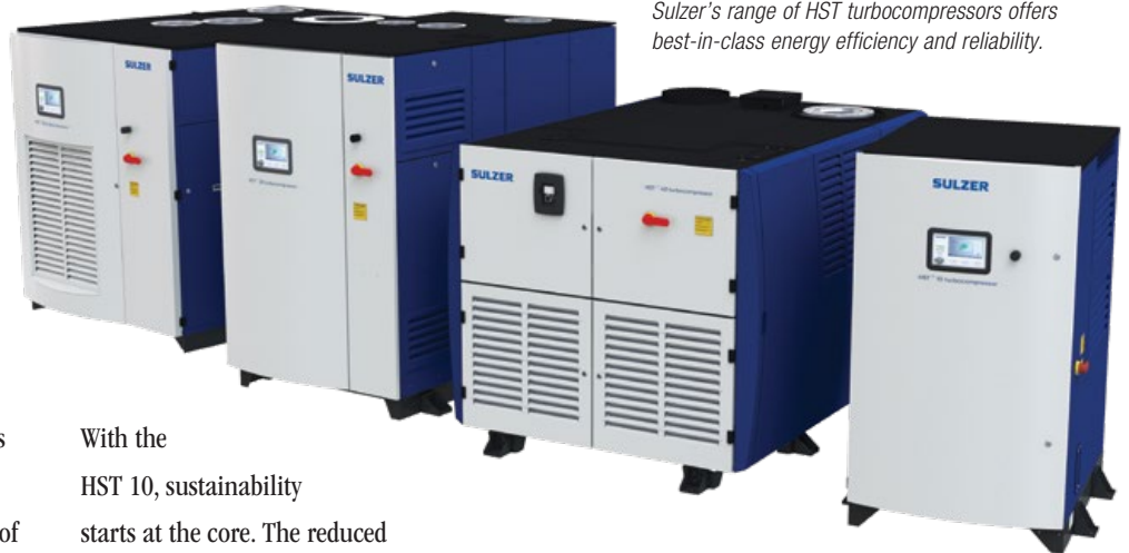
Sulzer's range of HST turbocompressors offers best-in-class energy efficiency and reliability.

The design of the HST 10 means there are no gears, mechanical bearings, pumps or separate cabinet cooling fans. The absence of these failure-prone components will contribute to excellent reliability. Combined, the lower energy costs and running expenses offered by these machines will quickly realize considerable savings in operational expenditure, which relates to a remarkable return on investment.