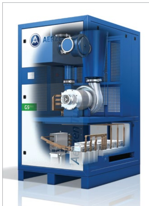
The Aerzen Turbo AT250 G5 Plus is a compact plug-and-play package and enables significant energy savings.

The AERZEN product portfolio includes rotary lobe compressors, positive displacement blowers, turbo blowers and screw compressors and, in addition to standard products, also offers customized special solutions. Digital services can be used to increase efficiency, availability and productivity in a sustainable and future-oriented manner. In addition, AERZEN After Sales Service offers the full range of services – from full maintenance contracts to repairs and modernizations of existing plants. For more information, visit https://www.aerzen.com .