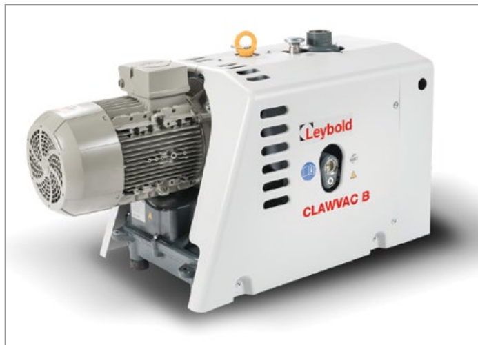
Leybold announced the CLAWVAC CP B, a claw vacuum pump for robust industrial applications.

CLAWVAC's design ensures that individual parts can be replaced quickly when necessary, since users have easy access to all surfaces that come into contact with the media. The housing and claws, for example, can be disassembled with no need to readjust the gear control afterwards. The silencer not only reduces the noise level but also ensures that the condensate is drained off through the drain opening. All of these benefits