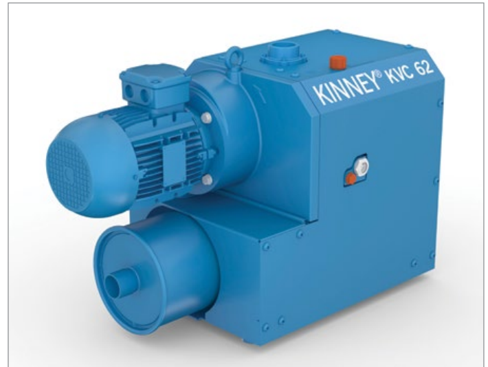
MD-Kinney has expanded the KVC Dry Claw series of vacuum pumps with the addition of the KVC62 and KVC122 Extreme Duty (XD) models.

Kinney Vacuum Company was founded in 1907 by J. Royal Kinney in Jamaica Plain, Massachusetts, and is best known for the design of the first rotary piston vacuum pump in 1909. This technology was first used in food, chemical and other process industries. In 1927, Kinney published the first compilation of technical data that would be the industry standard for vacuum pump sizing. In 1950, Kinney merged a positive displacement blower with vacuum pumps, making the first booster pump combo. In 1972, Kinney introduced a full line of liquid ring vacuum pumps in the U.S. market with both single and two stage pumps.