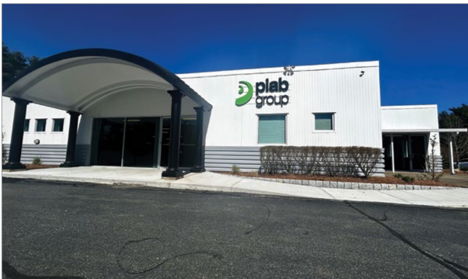
Piab USA is relocating its headquarters to a new, state-of-the-art office facility in Canton, Massachusetts.

The new Canton office is designed to foster innovation and collaboration among Piab's teams. Equipped with modern amenities, advanced technological tools and spacious conference areas, the facility will enhance the company's ability to develop and deliver high-quality automation solutions. The office layout encourages open communication and